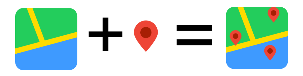
Figure 2: Legacy map application with the addition of modern widgets gives a whole new application

The compositor provides a clear benefit by allowing new symbology to leverage modern technology on legacy applications, with minimal or no additional cost. The compositor takes advantage of open standards such as EGL's EGL_EXT_compositor or Vulkan's KHR_Display, allowing applications to be written without knowing the final target hardware.